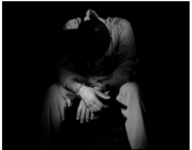
Domestic violence is a crime.

It doesn't have to be this way. If you abuse, you can choose to stop. Call us.